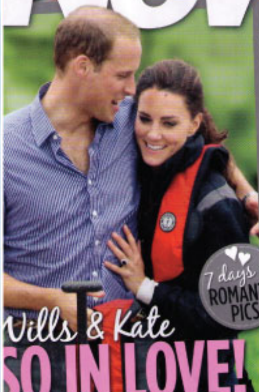
Wills & Kate