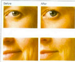
The Intraceuticals Infusions treatments drastically reduce the visibility of fine lines around eyes and mouth

How crucial is training? How do you think the technicians keep themselves abreast with the change in the technology? How often is training updated? Training is an important facet at Intraceuticals since it is the only professional skincare company that is qualified to apply pressurized, therapeutic-grade oxygen, along with the targeted serums directly to the skin. It is completely non-invasive where the oxygen is infused. We brief the trainees about the techniques and the introductions in the field.