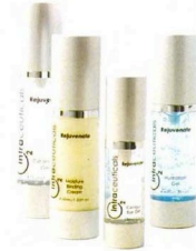
A range of skincare products by Intraceuticals

What are the side effects and downtime of the treatments? There is no downtime and side effects associated with Intraceuticals Infusions. It makes the skin look younger.