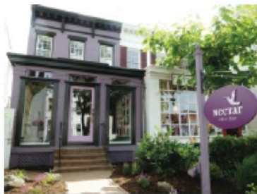
Nectar Skin Bar in Georgetown